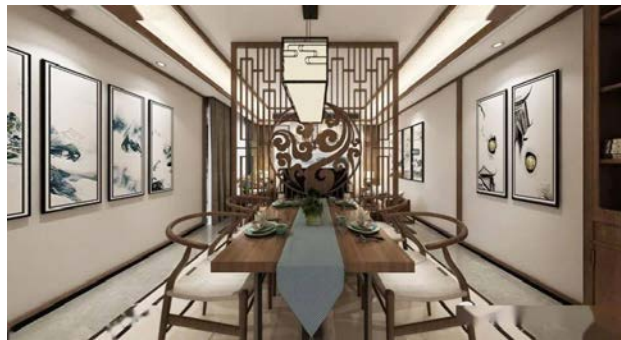
Figure 2 Combination of traditional decoration and modern interior

With the changes of the times, there are many unique decorative forms in the existing traditional decorative elements, which are worthy of study and application by designers, and many traditional decorative elements can be directly applied to modern interior design. Chinese traditional furniture with him The unique form exudes a unique charm, full of noble spirit. It can be said that adding a few pieces of Chinese style furniture in interior design can change the temperament of the whole space. As shown in Figure 2.