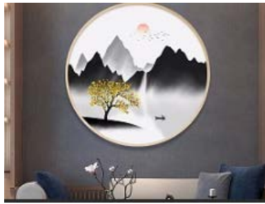
Figure 3 Combination of calligraphy and painting art with modern interior design

also used in the TV background wall, ceiling, floor and other decorative modeling. While retaining the formal characteristics of traditional decorative elements, the interior design keeps its independence.